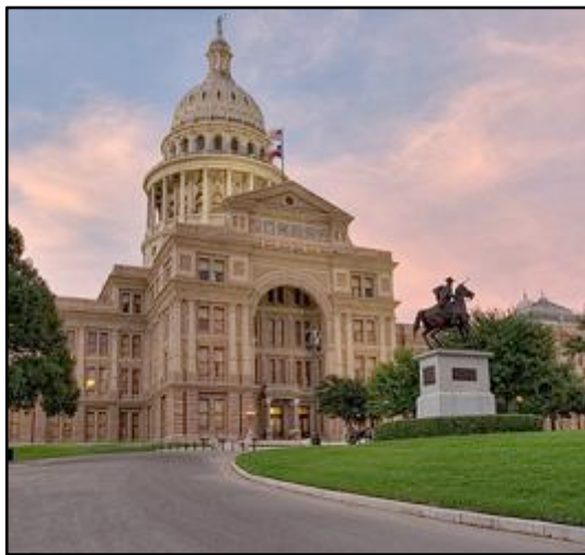
Texas State Capital Building in Austin.

As of April 2011, texting and driving is legal in Texas unless you are under the age of 18 or going through a school zone. Also, all school bus drivers are prohibited from using cell phones if any children are on their bus.