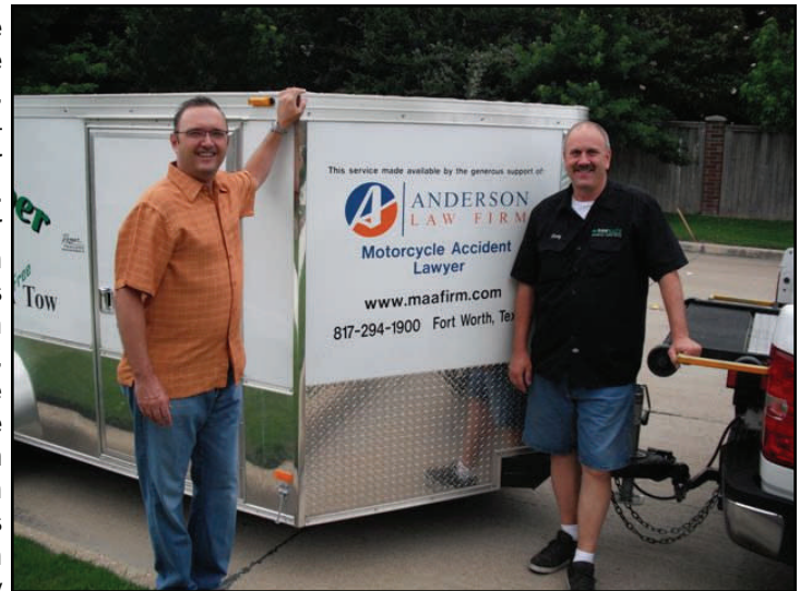
The Ride Safe Ride Sober Trailer

expected to be alive today, as he was only given a 3 year life expectancy. But he is alive and well and ready to roll.