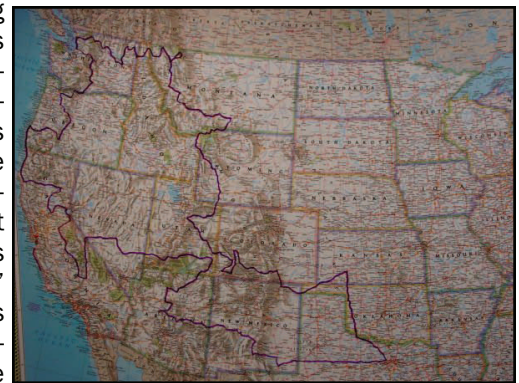
Proposed travel route